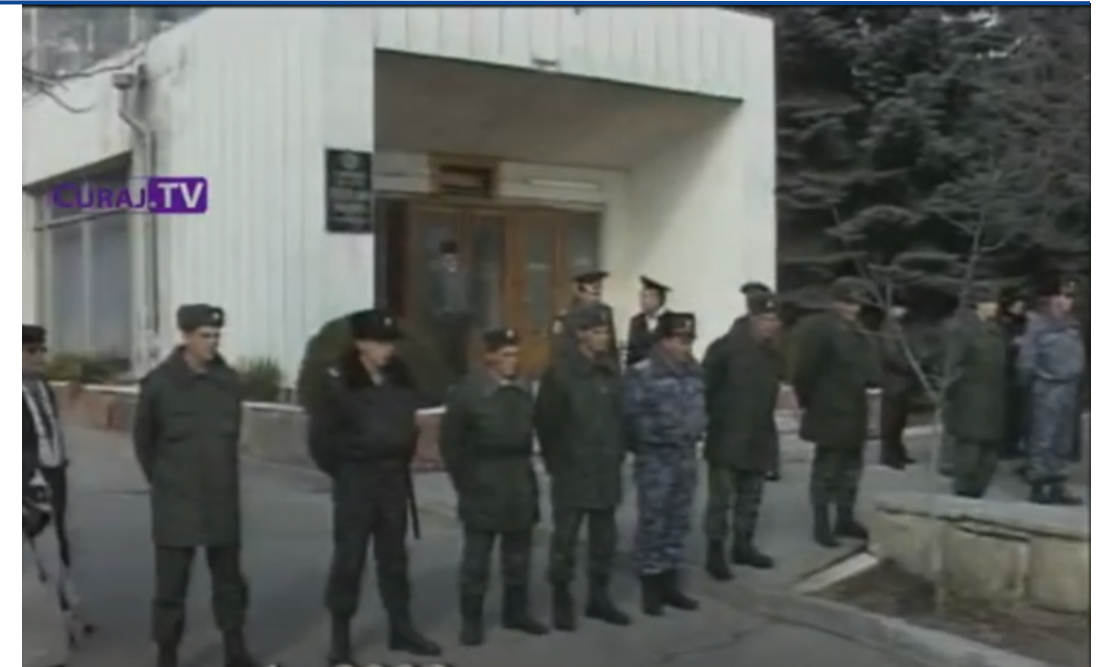
THE UNDECLARED „STATE OF EMERGENCY”